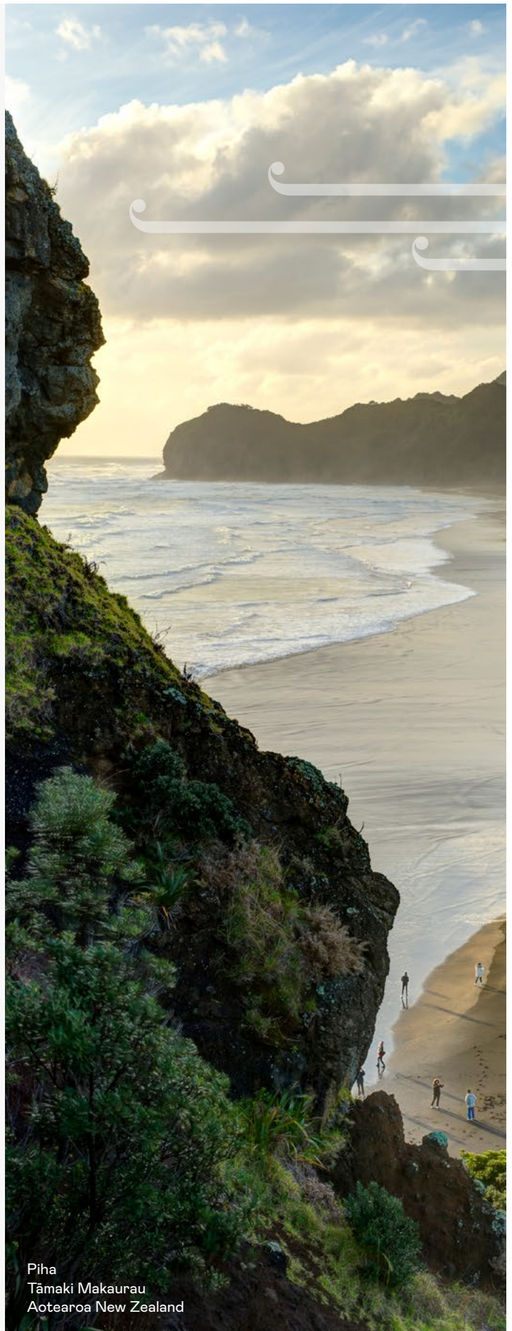
Piha Tāmaki Makaurau Aotearoa New Zealand

*Fidelity Life has an A- (Excellent) financial strength rating from A.M. Best. The rating scale that this rating forms part of is available for inspection at our offices. For more information please visit Fidelity Life's financial strength page .